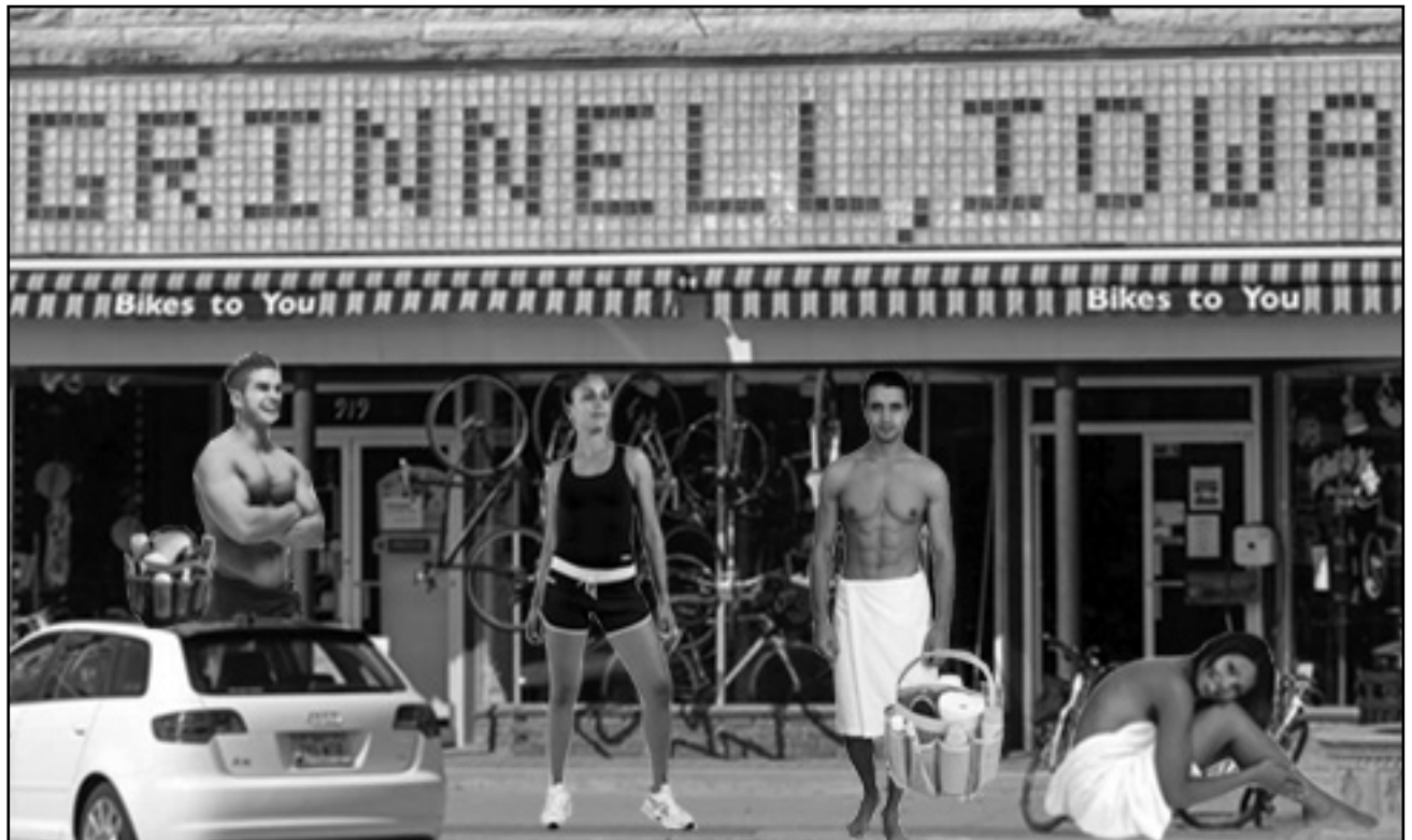
Above: Students wait in public to take their turn attending to basic hygienic needs