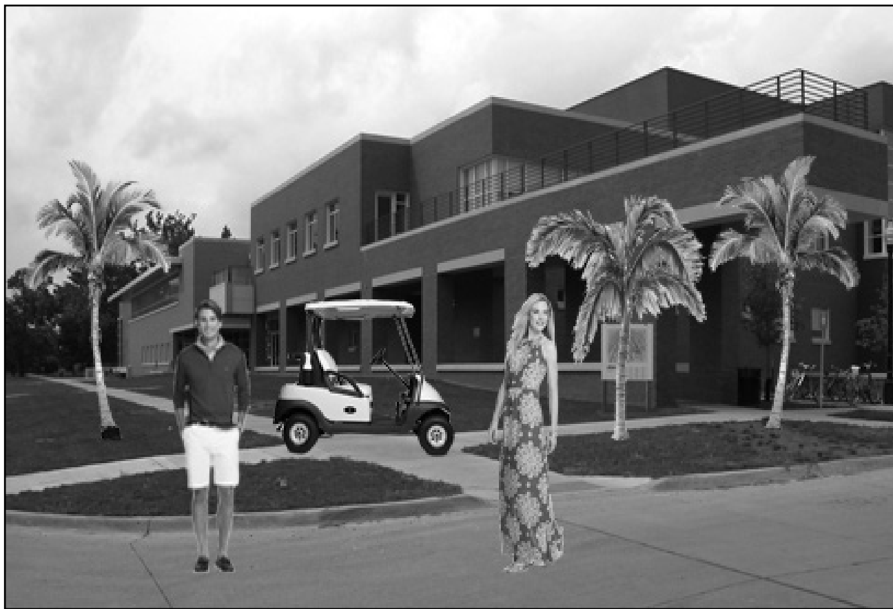
Above: Grinnellians enjoy the new GCCGC facilities

NORTH OF THE BEAR-Last week, an email was sent to the student body announcing that the Board of Trustees of Grinnell College signed a deal purchasing the Grinnell Country and Golf Club. The new purchase officially merges the two institutions into The Grinnell College Country and Golf Club, GCCGC. As soon as the new contract is signed, all students will officially become members of the Club College.