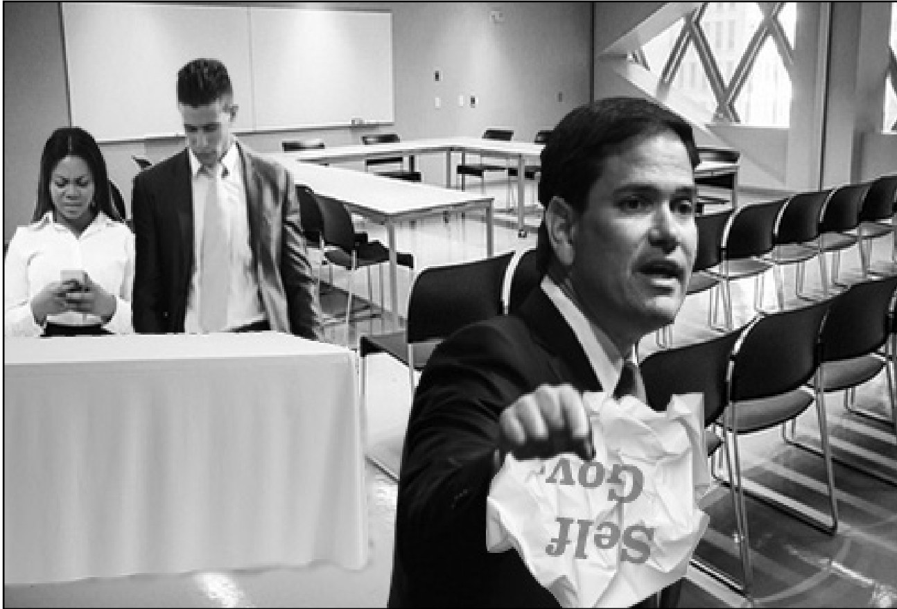
Above: Senator Rubio crumples up a Self-Gov sign as staffers work on damage control

H Y V E E A N D BROWNELLS — Facing crowds as large as twenty people, Senator and presidential candidate Marco Rubio visited Grinnell last Tuesday as part of a trip through Iowa. He stopped at Hy-Vee and Brownells during his visit.