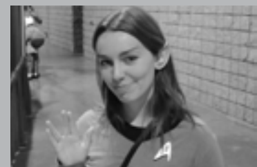
Hard Core Trekkie

Looks like a worn teddy bear "It should be Star Wars Episode VII: Revenge of the Ewoks! You think you can use us as pawns in your rebellion? There will be no mercy!"